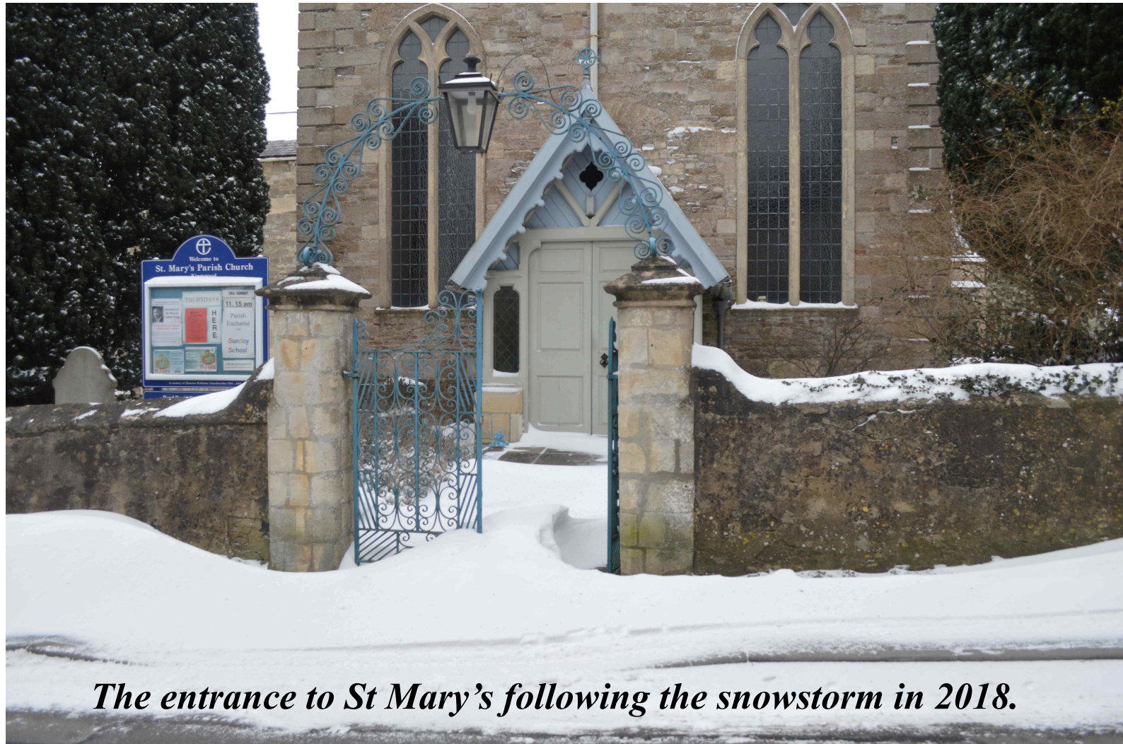
The entrance to St Mary's following the snowstorm in 2018.

Please note that all the events are subject to change. For more details please see the Church Notice Boards or