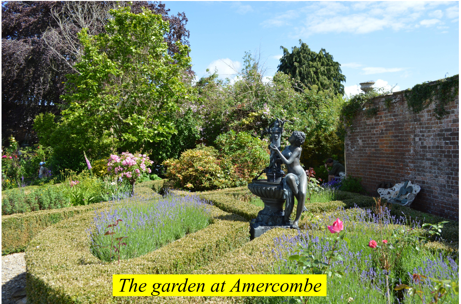
The garden at Amercombe

Please note that all the events are subject to change. For more details please see the Church Notice Boards or