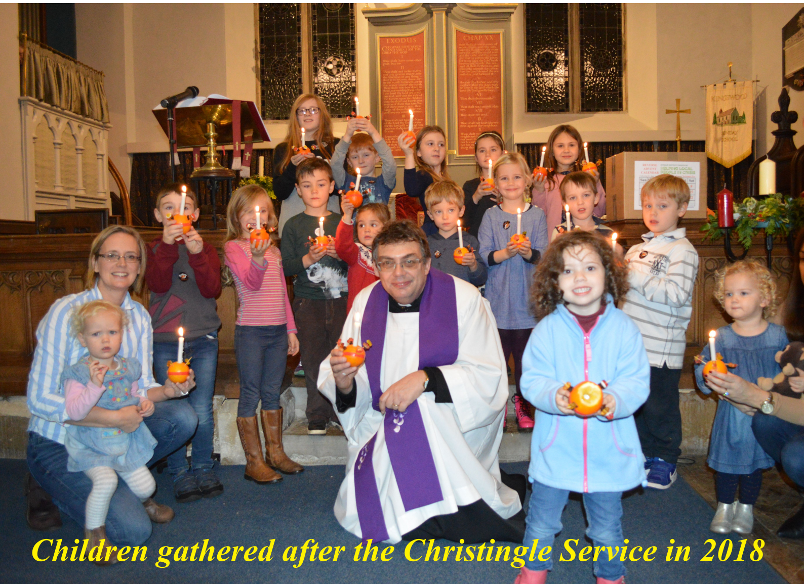
Children gathered after the Christingle Service in 2018

A guide to some of the events and services organised by the churches in Kingswood supporting our mission and ministry here and across the world.